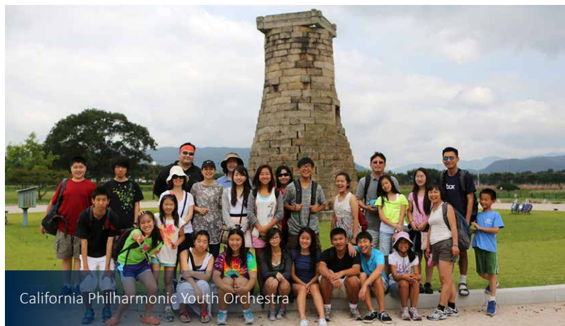
California Philharmonic Youth Orchestra

The interest by the Chinese in Western culture is such that an American orchestra, choir or concert band can captivate a large and enthusiastic audience no matter where it performs. Imagine your musical group performing near the Great Wall, an ancient city square, a cultural center auditorium, or perhaps participating in a musical cultural exchange at a Chinese school -- all these things are possible! Music Celebrations International and their official colleagues are ready to transport you to another world -- the Middle Kingdom!