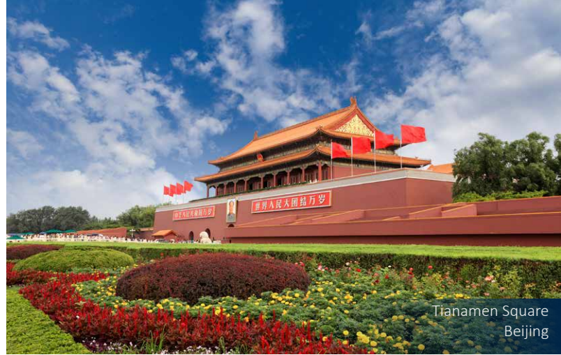
Tiananmen Square Beijing

Transfer to Beijing's airport for return flight