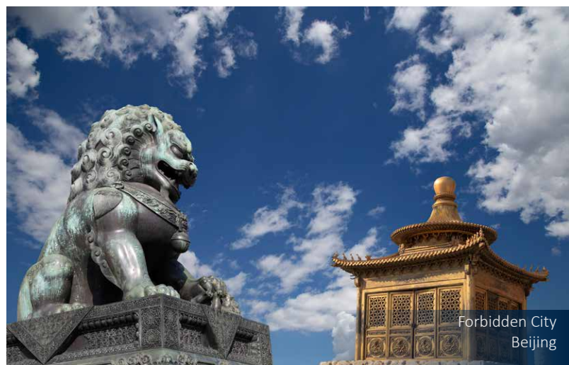
Forbidden City Beijing