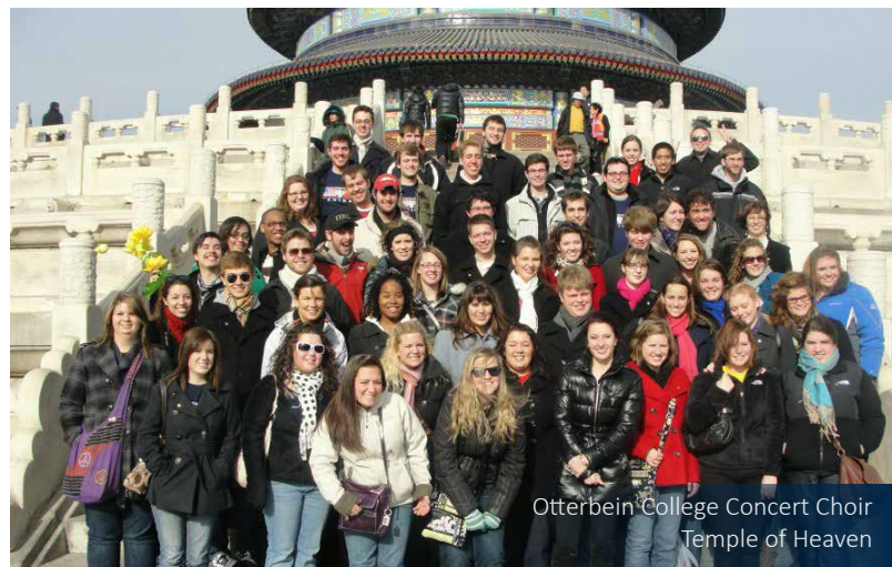
Otterbein College Concert Choir Temple of Heaven