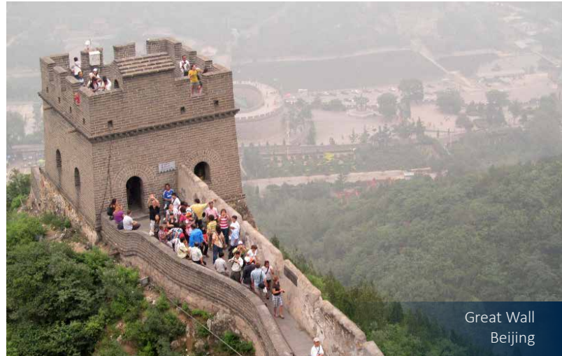
Great Wall Beijing