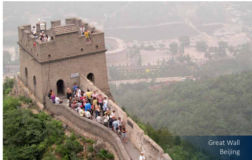
Great Wall Beijing